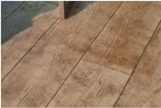
12" Wood Plank

PO Box 215, Pittsford, NY, 14534 P (585) 924-5185 F (585) 924-8558