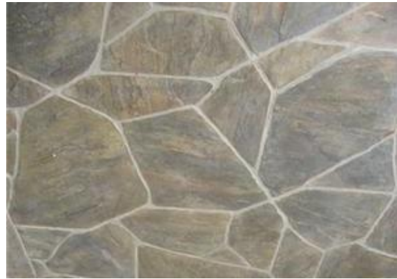
Large Random Flagstone