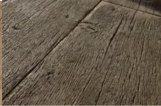
Gilpin's Falls Bridge Plank