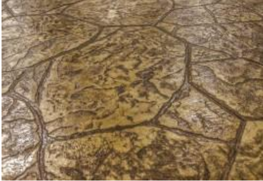
Appalachian Flag Stone

PO Box 215, Pittsford, NY, 14534 P (585) 924-5185 F (585) 924-8558