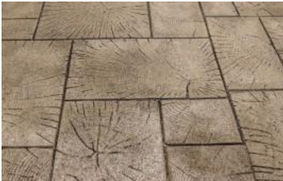
Wood Paver Ashlar