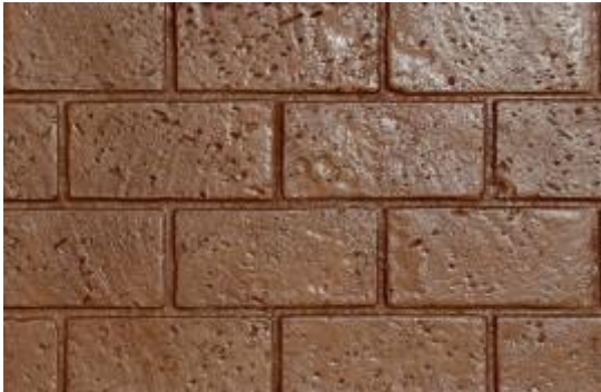
Running Bond Paver