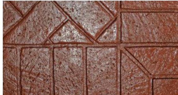
New Brick Soldier Course