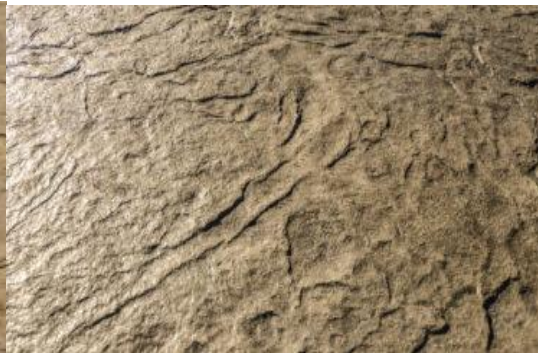
Hadley Creek Shale