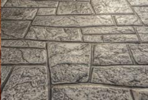
Dublin Cobble (Sidewalk only)