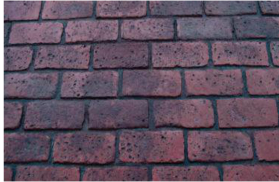
Old Chicago Running Bond Brick

PO Box 215, Pittsford, NY, 14534 P (585) 924-5185 F (585) 924-8558