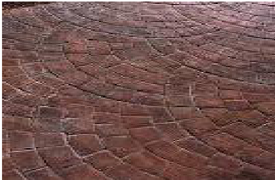
Limestone European Fan