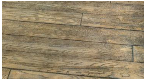
6" Wood Plank