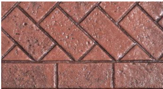
New Brick Sailor Course