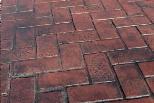
Herringbone Used Brick